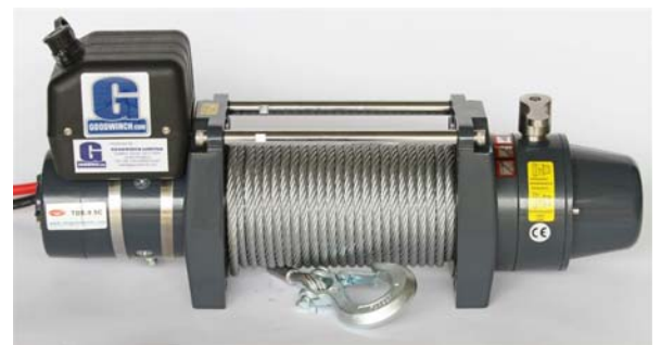
Our TDS-12.0c Goldfish winches are ideal for recovery trucks winching up to 4 tonnes, and heavy off road use. Full of features and are waterproof out of the box.