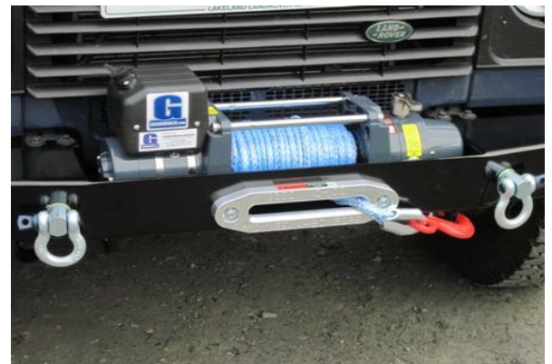
A TDS-Goldfish fitted to a Defender non A/C bumper with optional swivel recovery eyes and Dyneema® Bowrope