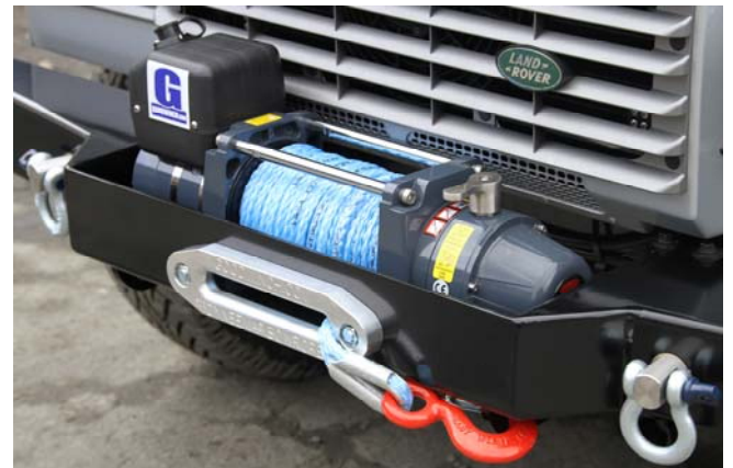
A TDS-Goldfish fitted to a Defender Air Con Bumper with optional swivel recovery eyes and Dyneema® Bowrope