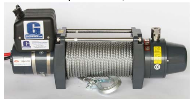
Our TDS-9.5c Goldfish winches are our best pulling winches for off road use. They are full of features and are waterproof out of the box. Off roaders usually choose this low profile model, the TDS-9.5c, as the winch person can easily see the drum.