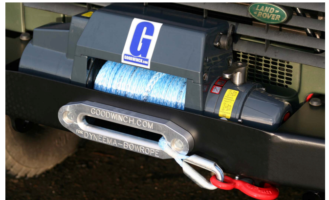
A TDS-Goldfish fitted to a Defender Bumper with optional Dyneema® Bowrope & Aluminium Hawse